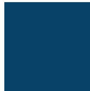
Pantone 7694 C C100 M77 Y34 K21 R0 G65 B107 Web: #00416b